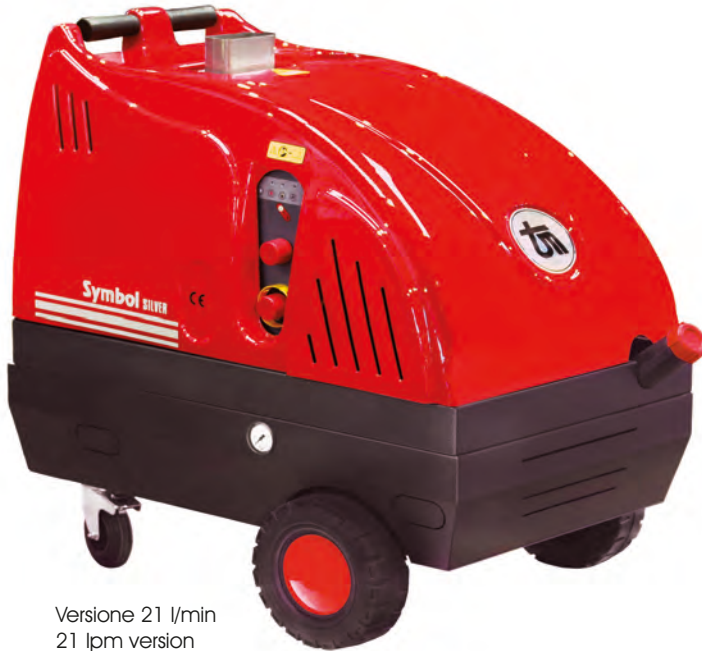
Versione 21 l/min 21 lpm version

Un design pensato per semplificare la manutenzione Easy accessibility and maintenance