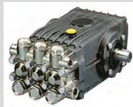
Pompa a pistoni in ceramica Ceramic plunger pumps TWS