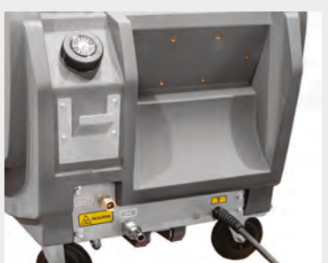
Dettaglio ingresso/uscita Inlet and Outlet