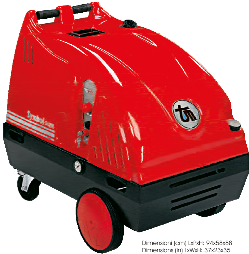
Dimensioni (cm) LxPxH: 94x58x88 Dimensions (in) LxWxH: 37x23x35

Dettaglio valvole regolazione e sicurezza Pressure regulator and safety valve