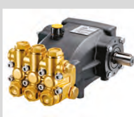
Pompa a pistoni in ceramica Ceramic plunger pumps TNM